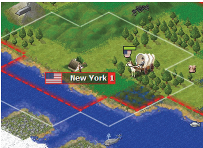
Figure 1: Freeciv city, terrain and resources

A significant aspect of Freeciv is managing the growth of cities. Ultimately, all wealth is produced by working the tiles within city boundaries. Each worked tile produces some amount of food points, production points, and trade points, depending on the terrain and resources present in that location, such as wheat, fish, or iron. This income is then applied to feed the citizens, build and maintain infrastructure and units, and fill the treasury. The exact relationships can be quite complex, factoring in, e.g., corruption, pollution, government types, and civil unrest.